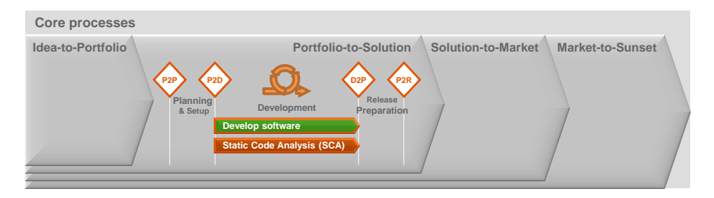
Figure 2: The core of the software development life-cycle at SAP